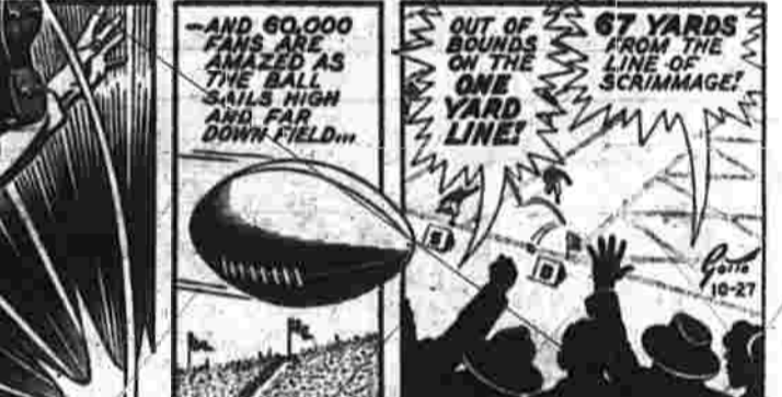
BY ROY CRANK