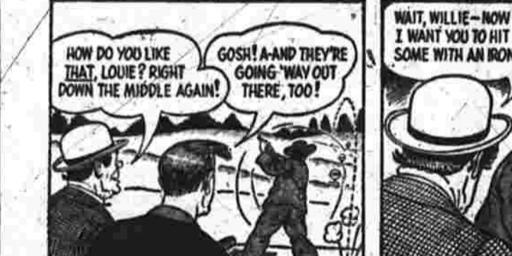
BY LANK LEONARD