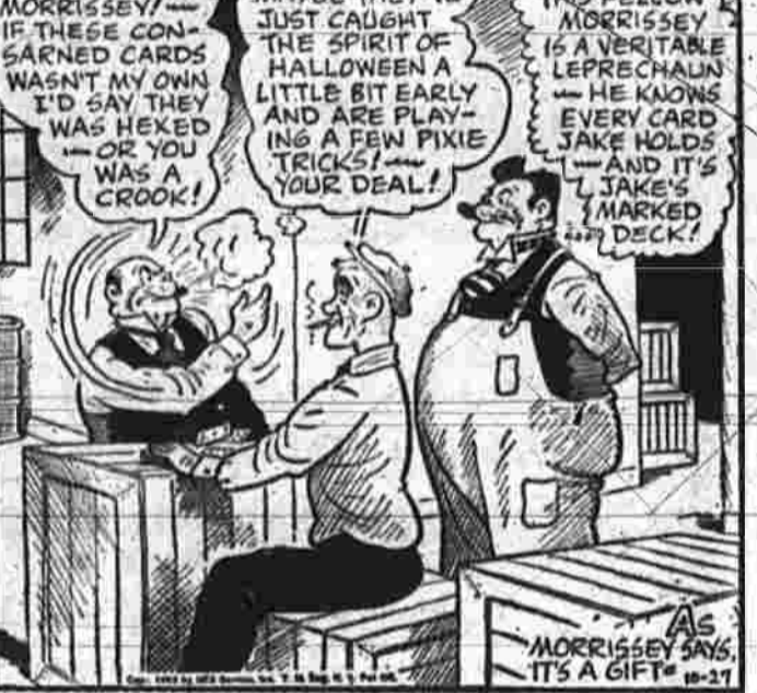
with MAJOR HOOPLE