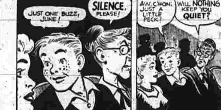
BY LANK LEONARD