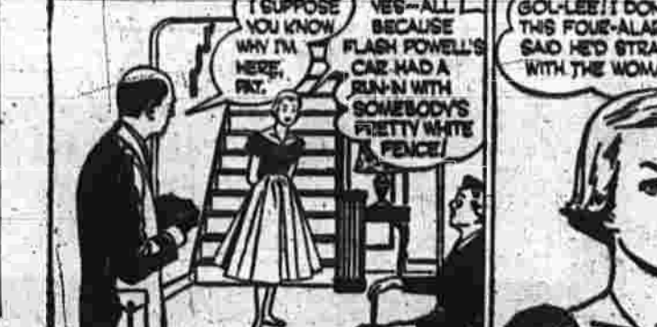
BY LANK LEONARD