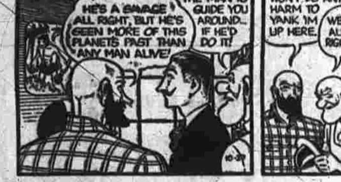
Here's Our Boy