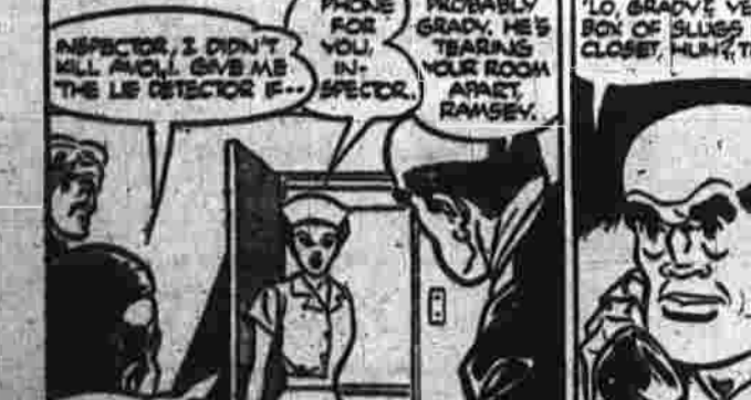
Note From Nunzio