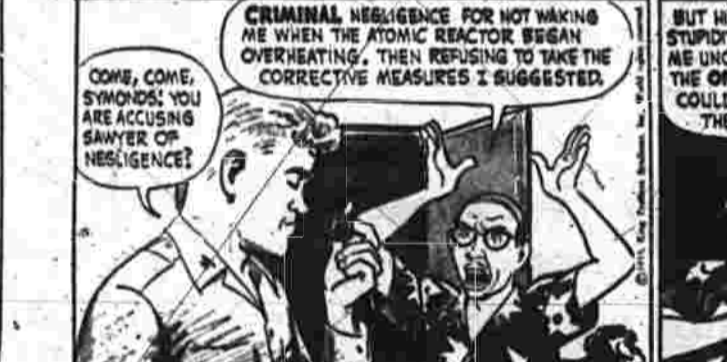
BY LANK LEONARD