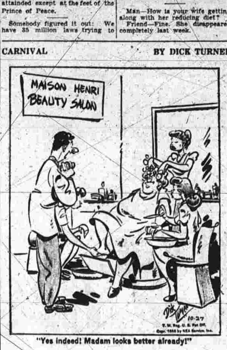
BY DICK TURNER