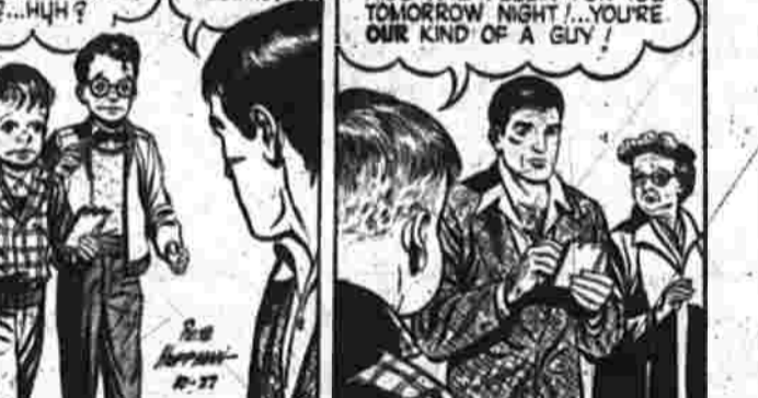
BY PETER HOFFMAN