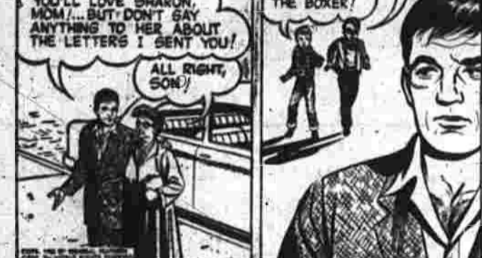
BY PETER HOFFMAN