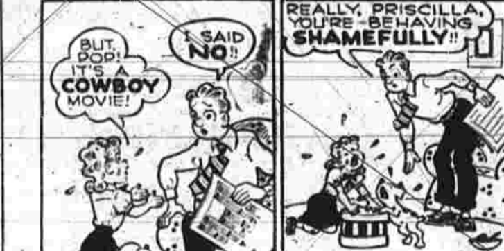
Just Goes To Show